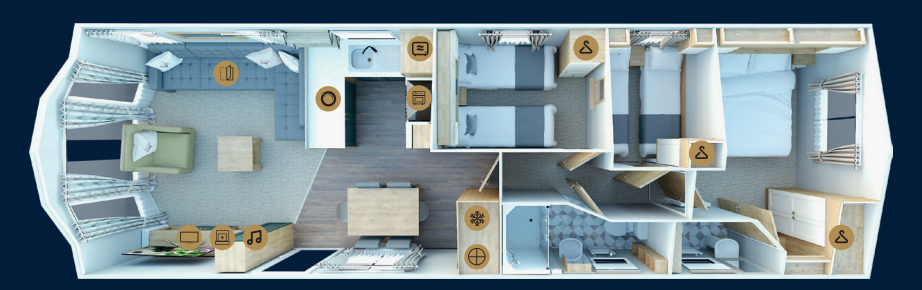
38 x 12 • 3 bedroom • sleeps 8