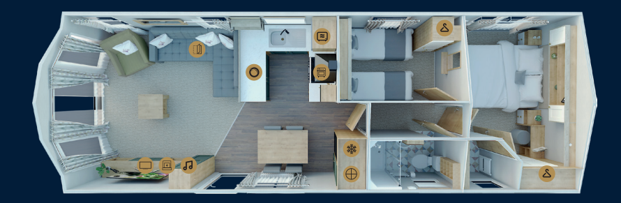
35 x 12 • 2 bedroom • sleeps 6