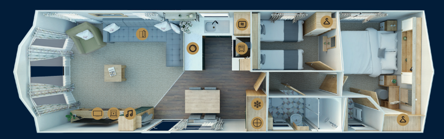
38 x 12 • 2 bedroom • sleeps 6