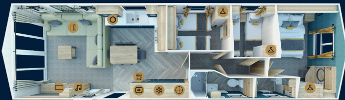
40 x 12 • 3 bedroom • sleeps 8