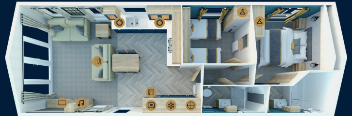
40 x 14 • 2 bedroom • sleeps 6