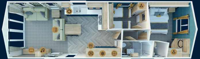
38 x 12 • 2 bedroom • sleeps 6