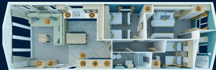
43 x 14 • 3 bedroom • sleeps 8