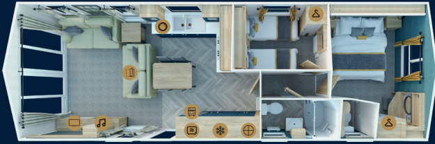
35 x 12 • 2 bedroom • sleeps 6