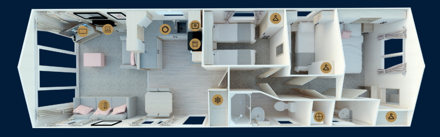
38 x 12 • 3 bedroom • sleeps 8