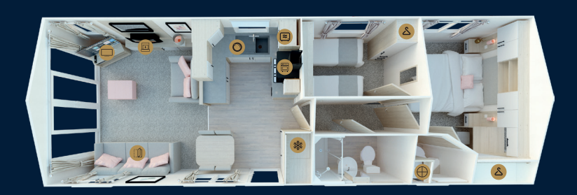
35 x 12 • 2 bedroom • sleeps 6