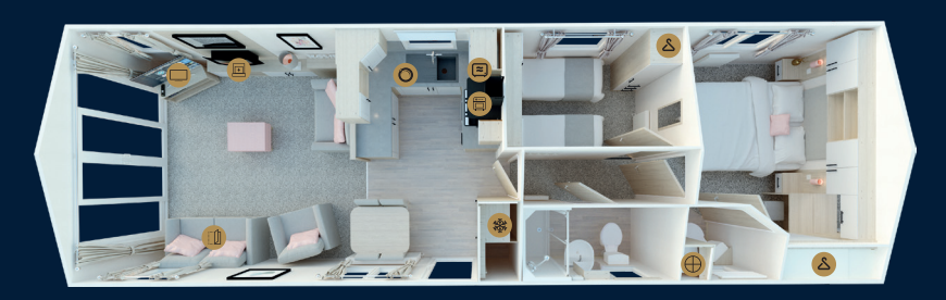
38 x 12 • 2 bedroom • sleeps 6