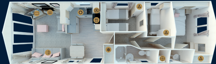
38 x 12 • 3 bedroom • sleeps 8