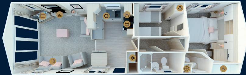
38 x 12 • 2 bedroom • sleeps 6