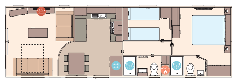
The St David 38ft x 12ft x 2 bedroom