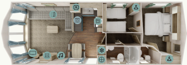
Sierra • 38 x 12 • 2 bedroom • sleeps 6