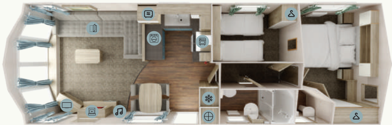
Sierra • 35 x 12 • 2 bedroom • sleeps 6