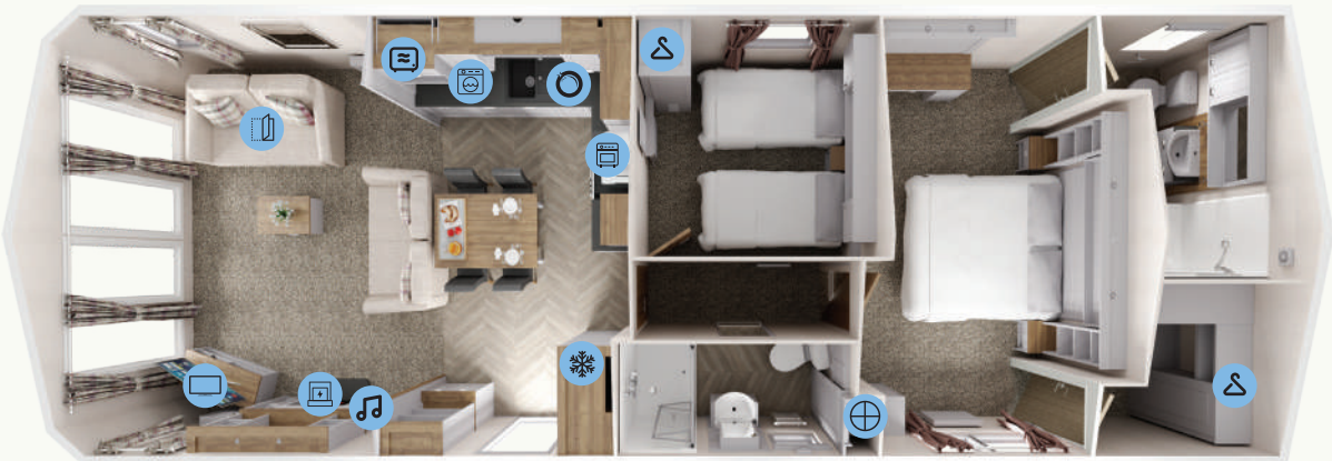
Sheraton Elite • 42 x 14 • 2 bedroom • Sleeps 6