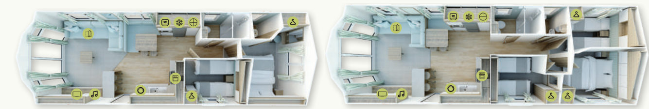
Brookwood • 35 x 12 • 2 bedroom • sleeps 6 Brookwood • 36 x 12 • 3 bedroom • sleeps 8